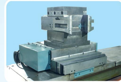
框式刀架 Turret tool holder